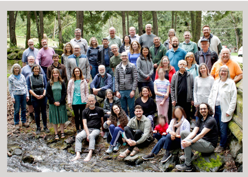
Some of the OC team at our Spring 2023 Staff Retreat

Therefore, be imitators of God, as dearly loved children, and walk in love, as Christ also loved us and gave himself for us, a sacrificial and fragrant offering to God. Ephesians 5:2